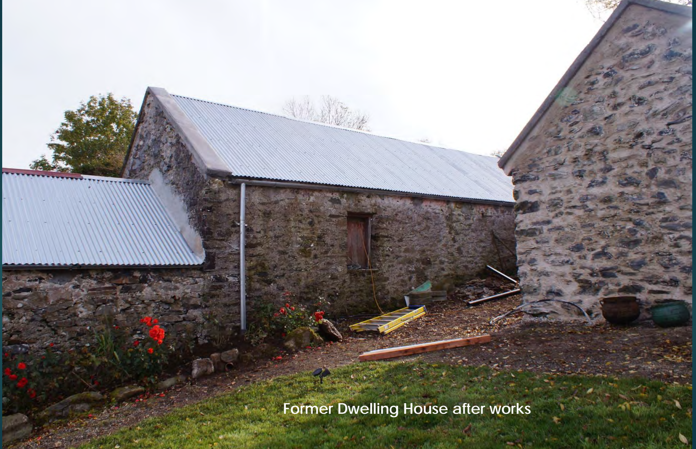
Former Dwelling House after works