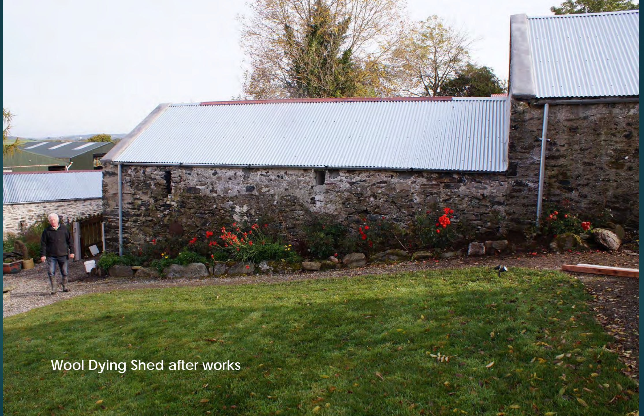
Wool Dying Shed after works