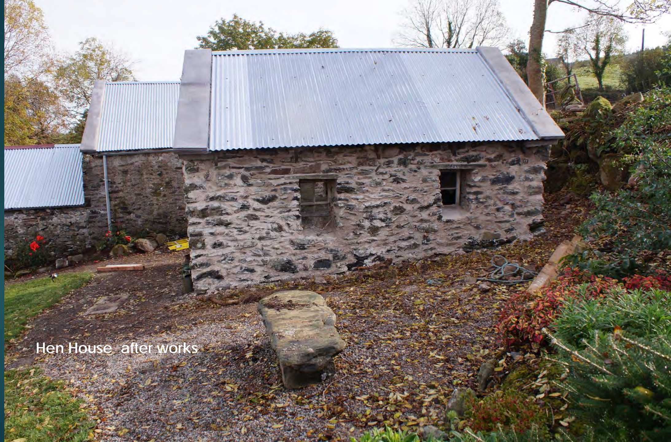
Hen House after works