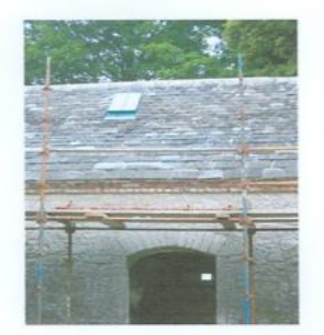
New slating graded to match original