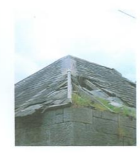
Lead roll hip detail from shed B fo be used as model for shed A