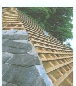
Existing light weight rafters predominately retained with new 3"x2" battens screwed to topside to improve rigidity and framing.