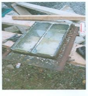
Rooflight being cleaned down