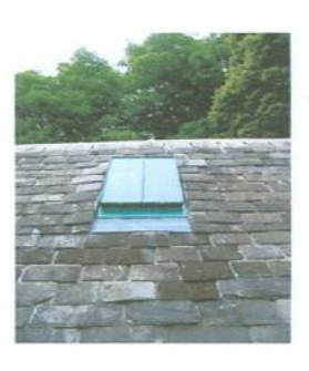
Completed rooflight in-situ