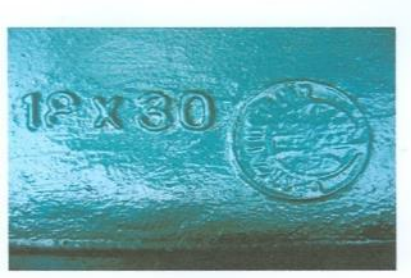
'Deanta in Eireann' imprinted on rooflight